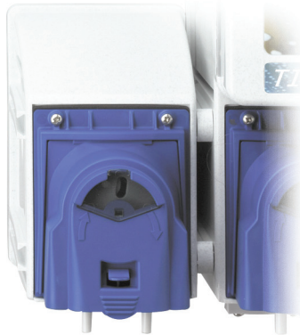
Sanitizer & Rinse Module 81-118-18

Dema's sanitizer and rinse module is an easy to add 3rd pump for any 2 product liquid / liquid or dry / liquid system. The 3rd pump easily integrates into the 2 product design for an attractive 3 product system. The pump module comes complete with everything needed for a quick installation.